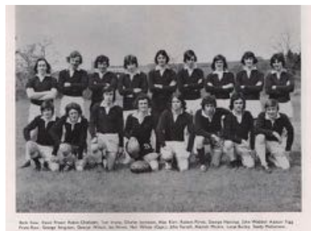
1975 Senior Rugby