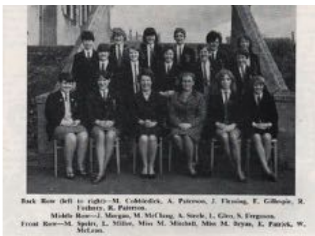
1967 nursing class