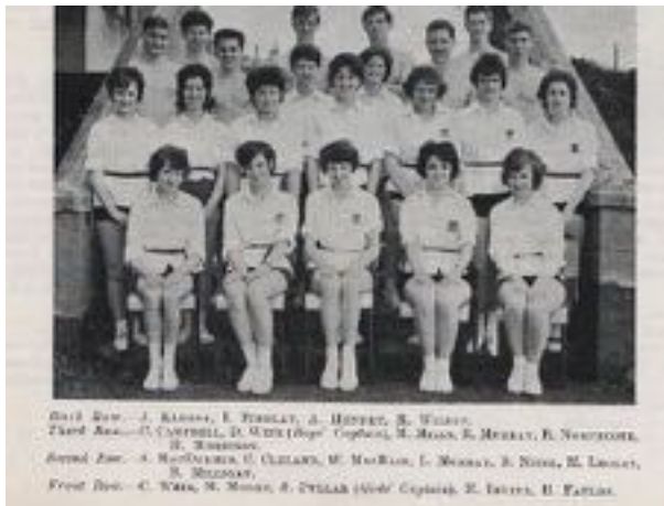
1963 Gym team