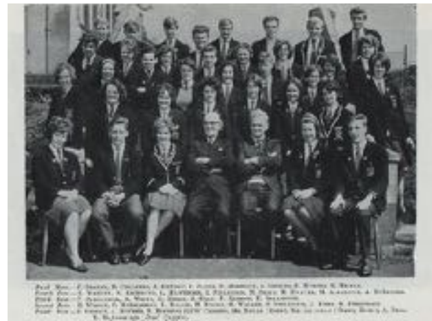
1964 Class VI