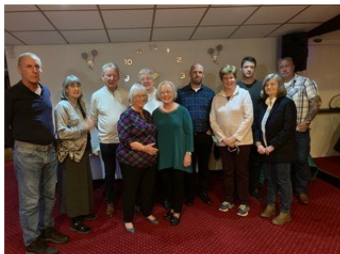
At Cumnock Bowling Green