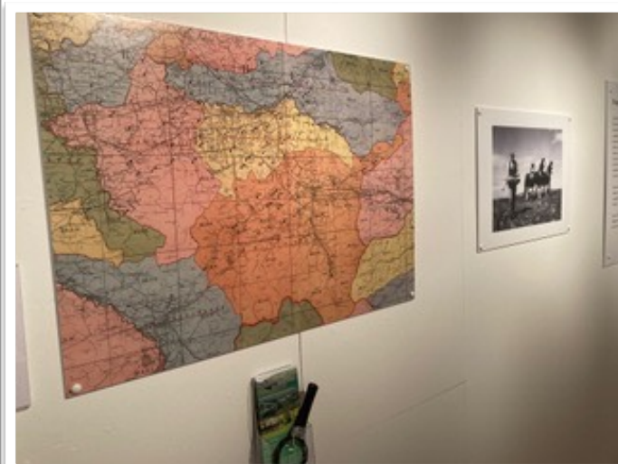
map with coloured pins denoting farms that are gone