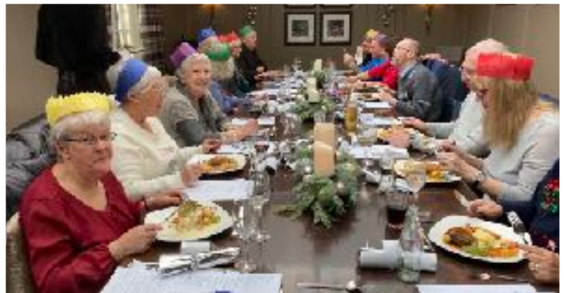
2024 Christmas lunch

16 attended on Monday 16 December at the Dumfries Arms Hotel.