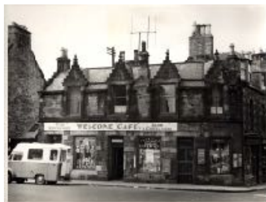
Ayr Road corner

https://langscotsmilecumnock.blogspot.com/