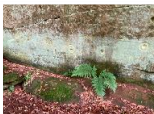
Cup & Ring Marks near Ballochmyle Viaduct