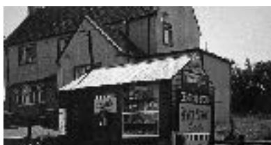
The Thistle Inn

Our proposal is to attempt to retake the old photos from the same position and compare them possibly using an app which morphs or slides from one to the other. We have selected 60 old photographs to be retaken. “Old” photographs could be as recent as 2016 before town centre redevelopments. Photos below from 2016 and 1966.