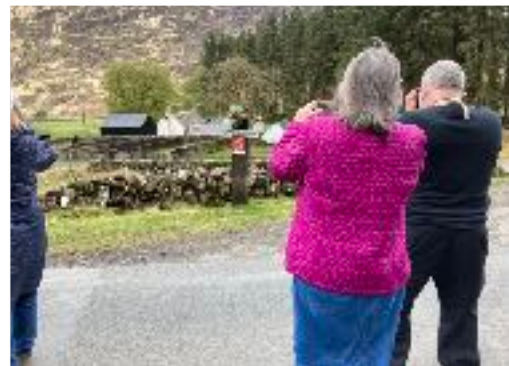
Photographing the ancestral pile