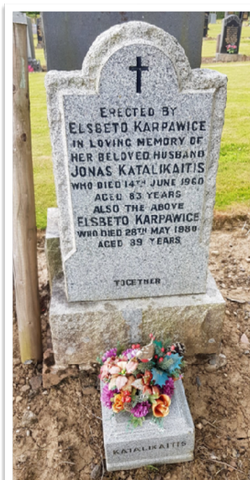
In Auchinleck New cemetery