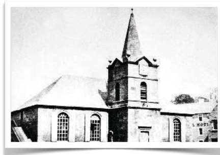
Pre. 1867 parish church in the Square

Yvonne Saunderson has completed the transcription of the earliest volume of Old Cumnock Kirk Session Minutes.