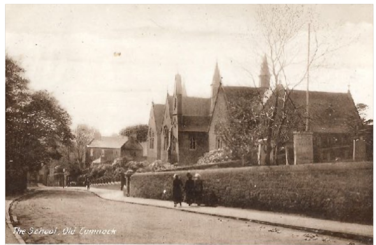
Cumnock Public School Barrhill road early 1900s The postcard was posted in 1917

https://www.youtube.com/@cumnockhistorygroup4110