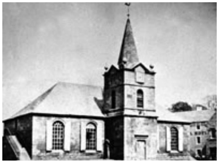
the church in the Square at the time of these minutes

Transcription of the Minutes of the Kirk Session of Old Cumnock Parish Church 1816-1860