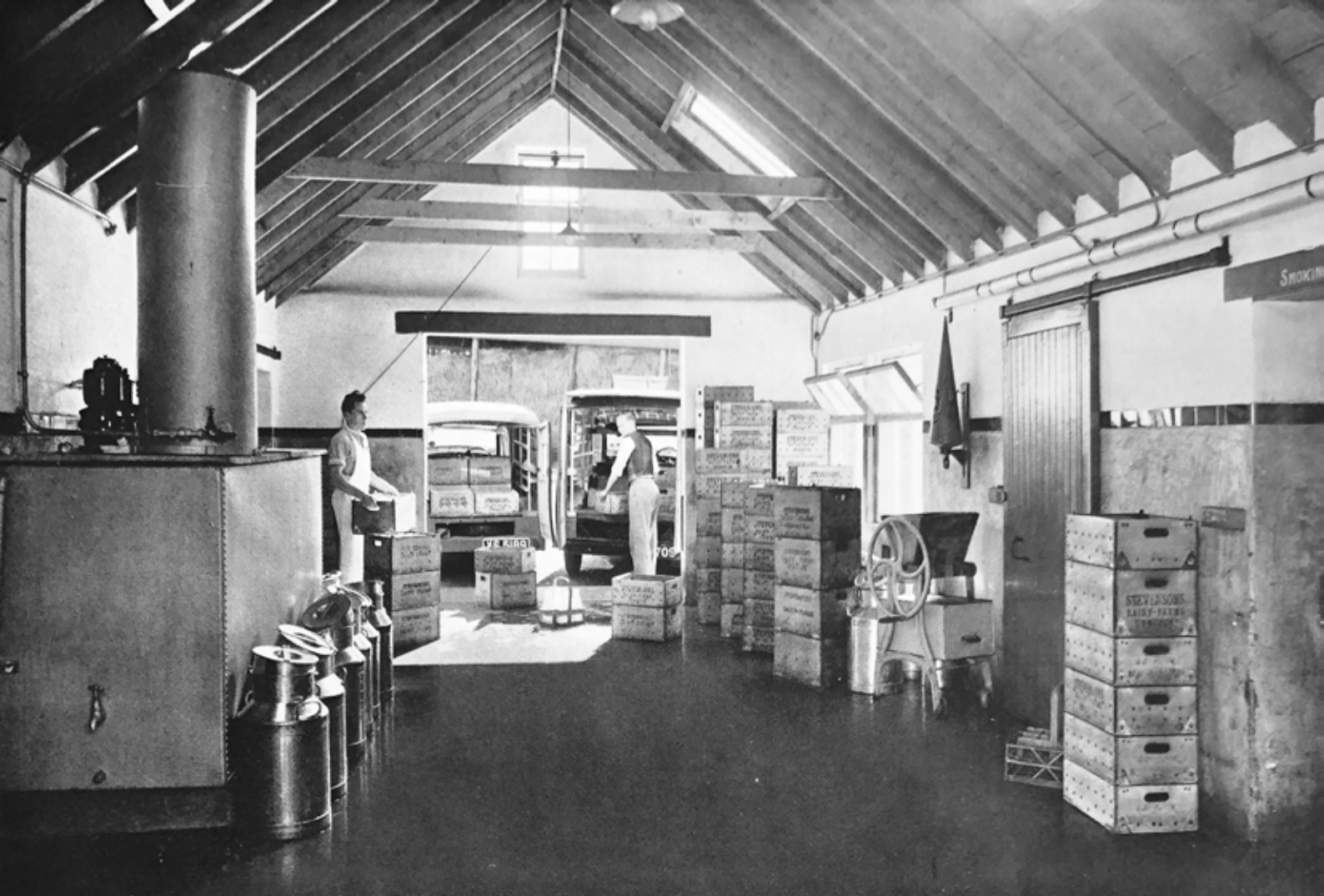
An Early Morning Scene in The Loading Shed

A commodious loading shed assists greatly in the handling and despatch, under cover, of our milk supply. Here our vans load up for distribution to schools, collieries, and customers over a wide area.