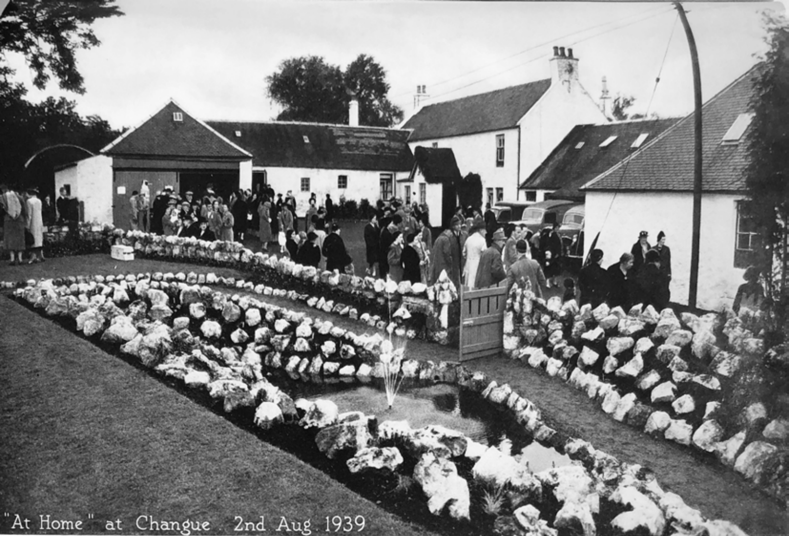
"At Home" at Changue 2nd Aug 1939

A day of happy memories. Many customers, leading officials in County and Agricultural Administration, and members of the medical profession, came to inspect our plant and premises. Almost 1,000 people attended, and proceeds were handed to local charities.