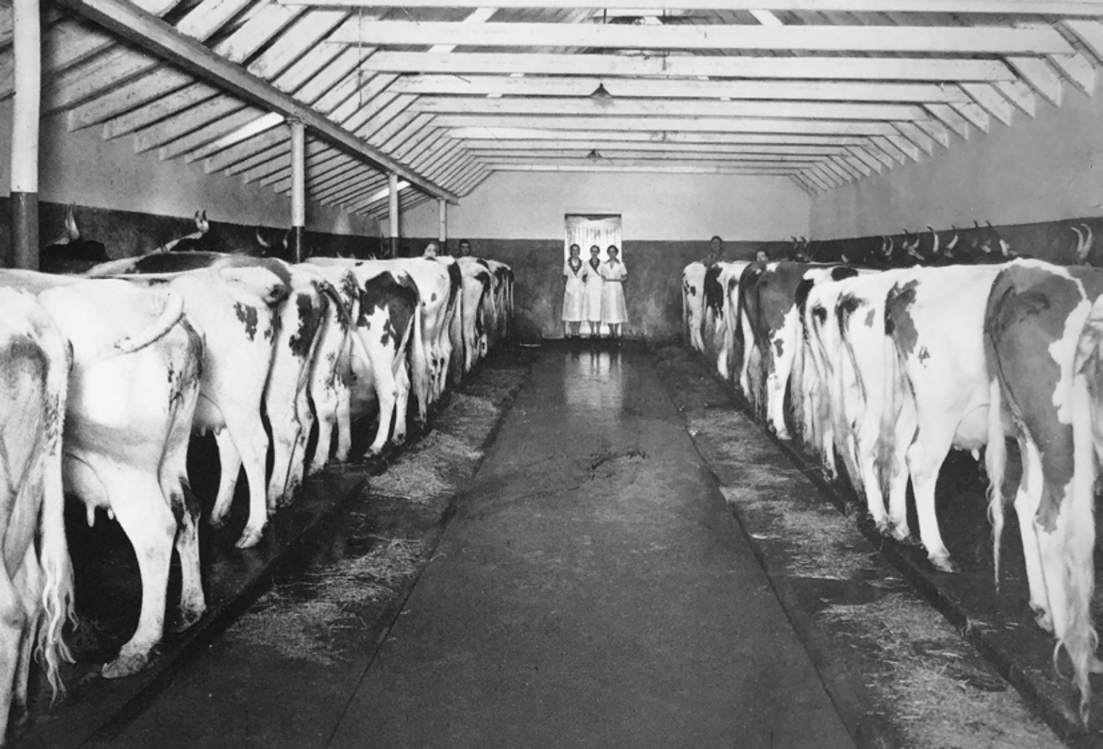
A Part of The Dairy Byre

We have been awarded Certificates of Merit by West of Scotland Agricultural College for Clean Milk Production. Light and airy byres assist largely in this work.