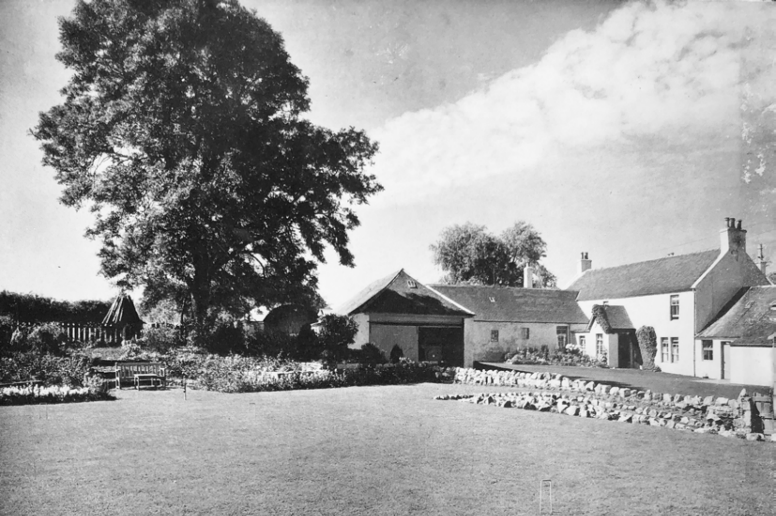
'Changue' and Its Immediate Surroundings