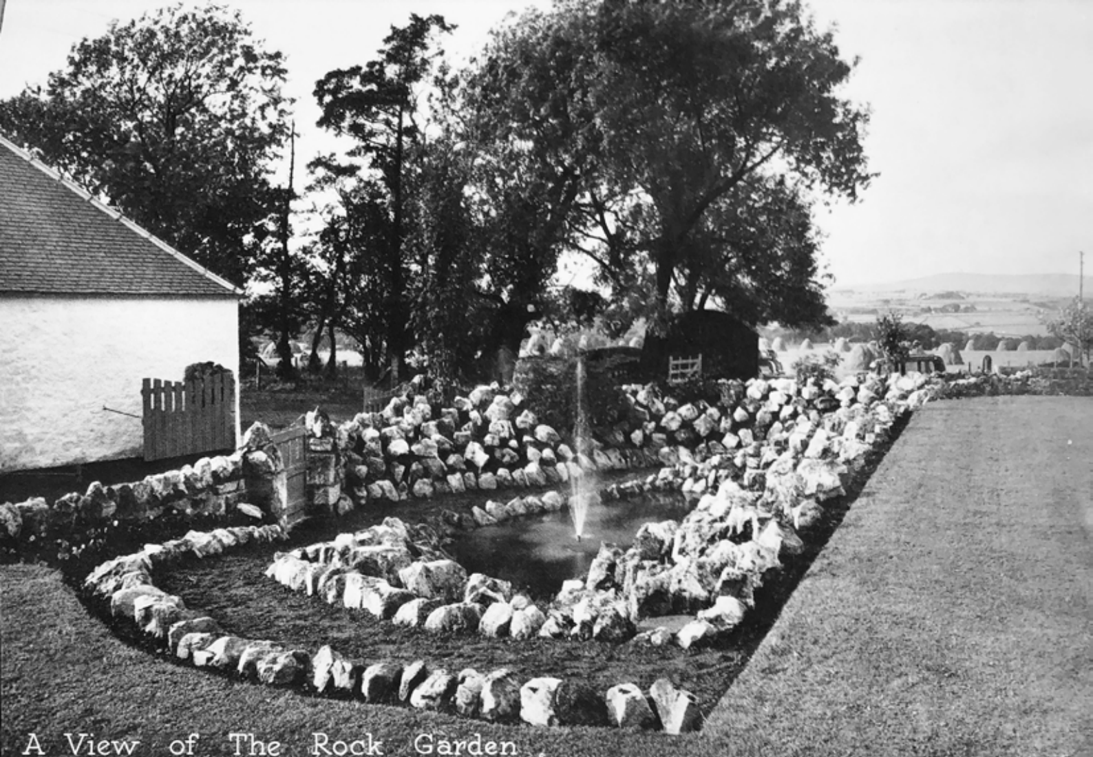
A View of The Rock Garden