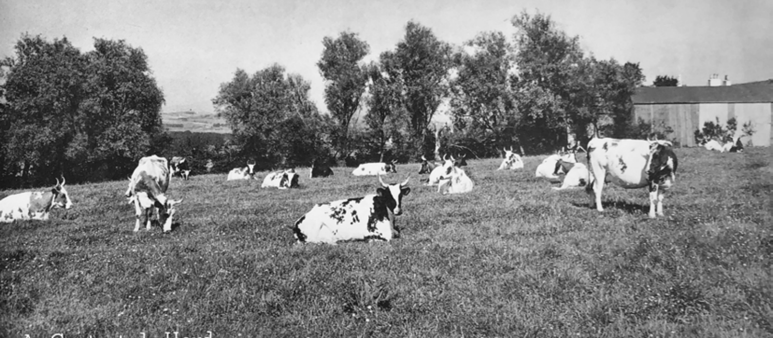
A Contented Herd

Some of our Pedigree Attested Ayrshires enjoying their afternoon rest. Rich pastures and healthy stocks are essential in the production of a reliable milk supply.