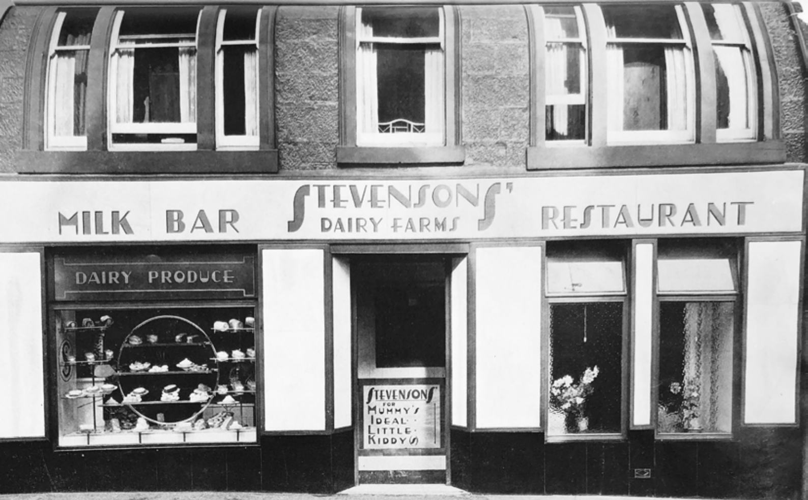
Our Premises in Cumnock

Our distributing centre, together with restaurant and bakery, are modelled on up-to-date lines. In addition to supplying the needs of our shop and tearoom, the bakery provides a large variety of hot-plate and fancy goods for distribution by the vans.