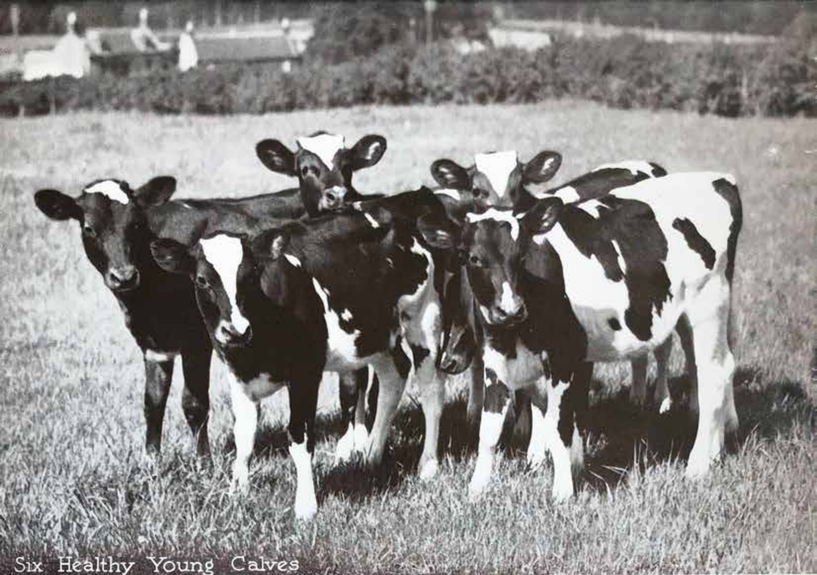
Six Healthy Young Calves

Sleek coated and alert, these promising youngsters are evidence of quality, breeding and rearing.