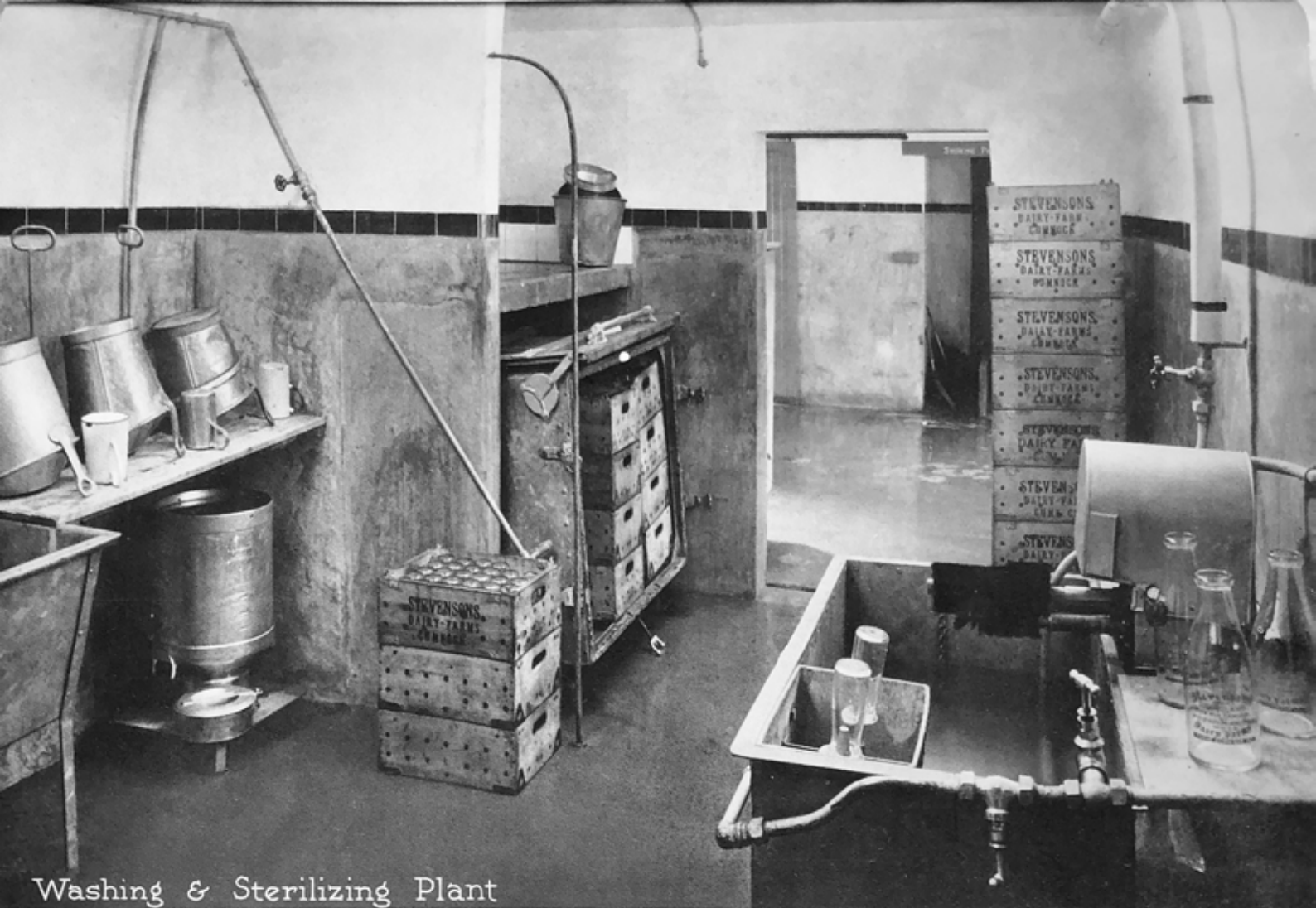
Washing & Sterilizing Plant

The greatest possible attention is given to the washing, rinsing and sterilising of all plant, utensils and bottles. Modern machinery is installed and an excellent water supply is available.