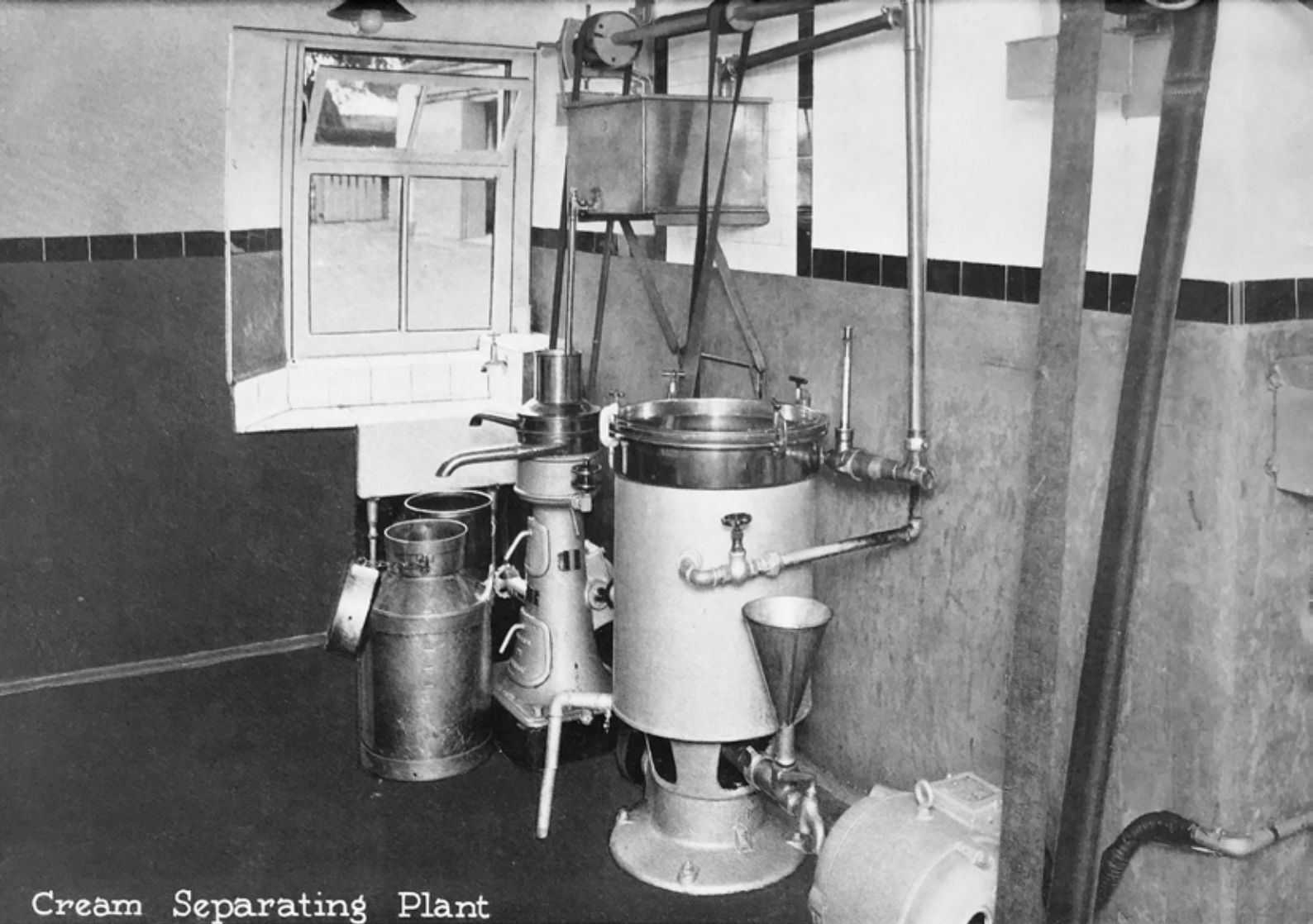
Cream Separating Plant

Suitable machinery is installed for efficient butter and cream production. Made from Tuberculin Tested Milk, these products are of first quality.